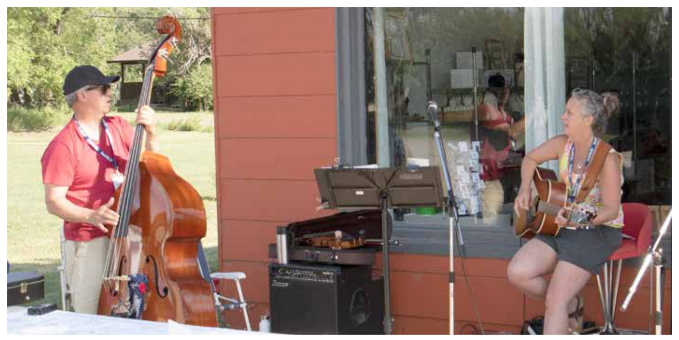
Skudesnes Harbour performing in Loreburn [2 of 3 band members pictured]

REPORT 2 OF 2 FROM MARGARET BESSAI