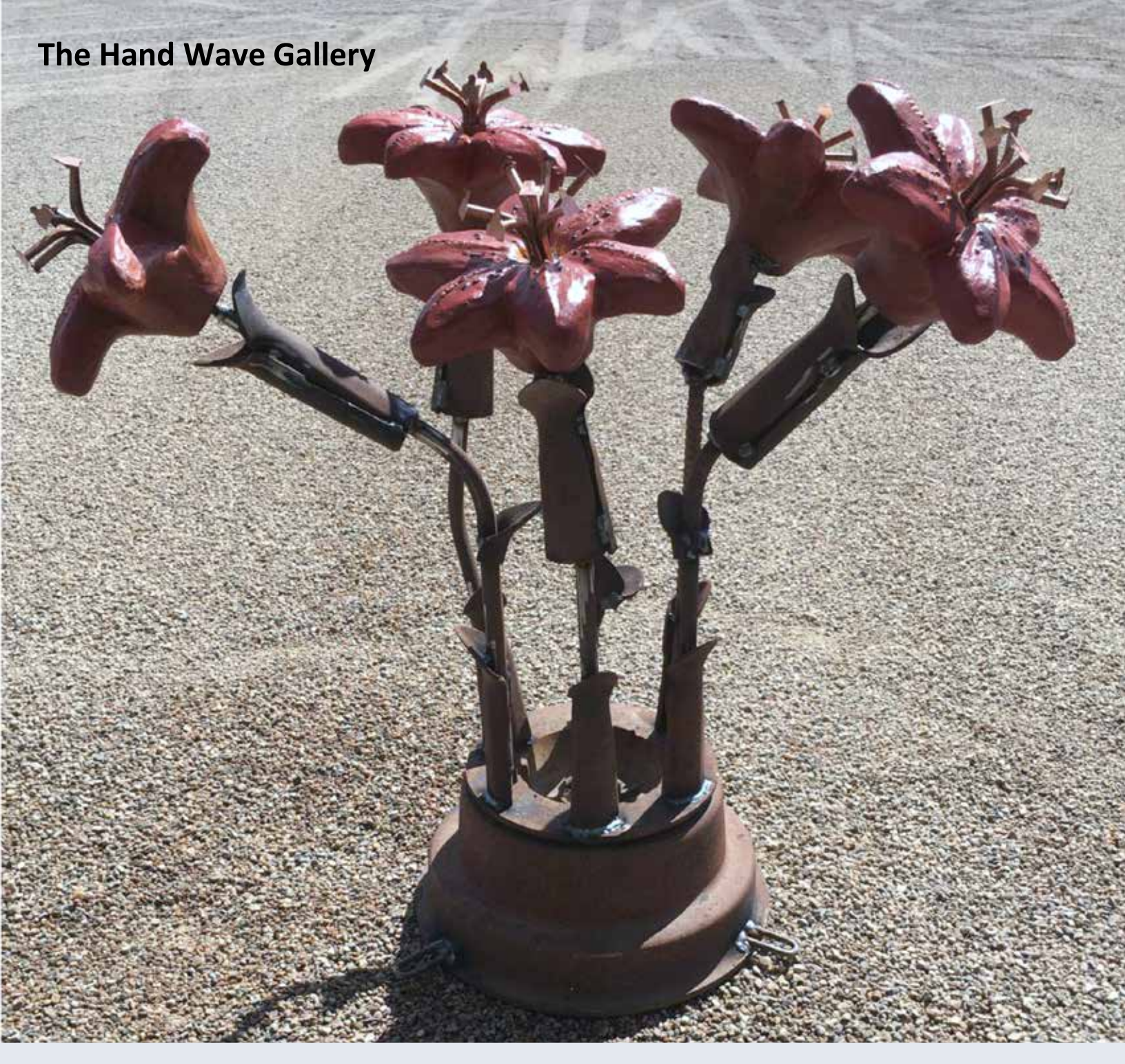
"Flora" a mixed media sculpture exhibition at the Hand Wave Gallery Garden & Interior Gallery