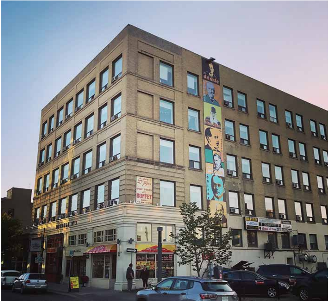
Drinkle Building, Saskatoon 2018.