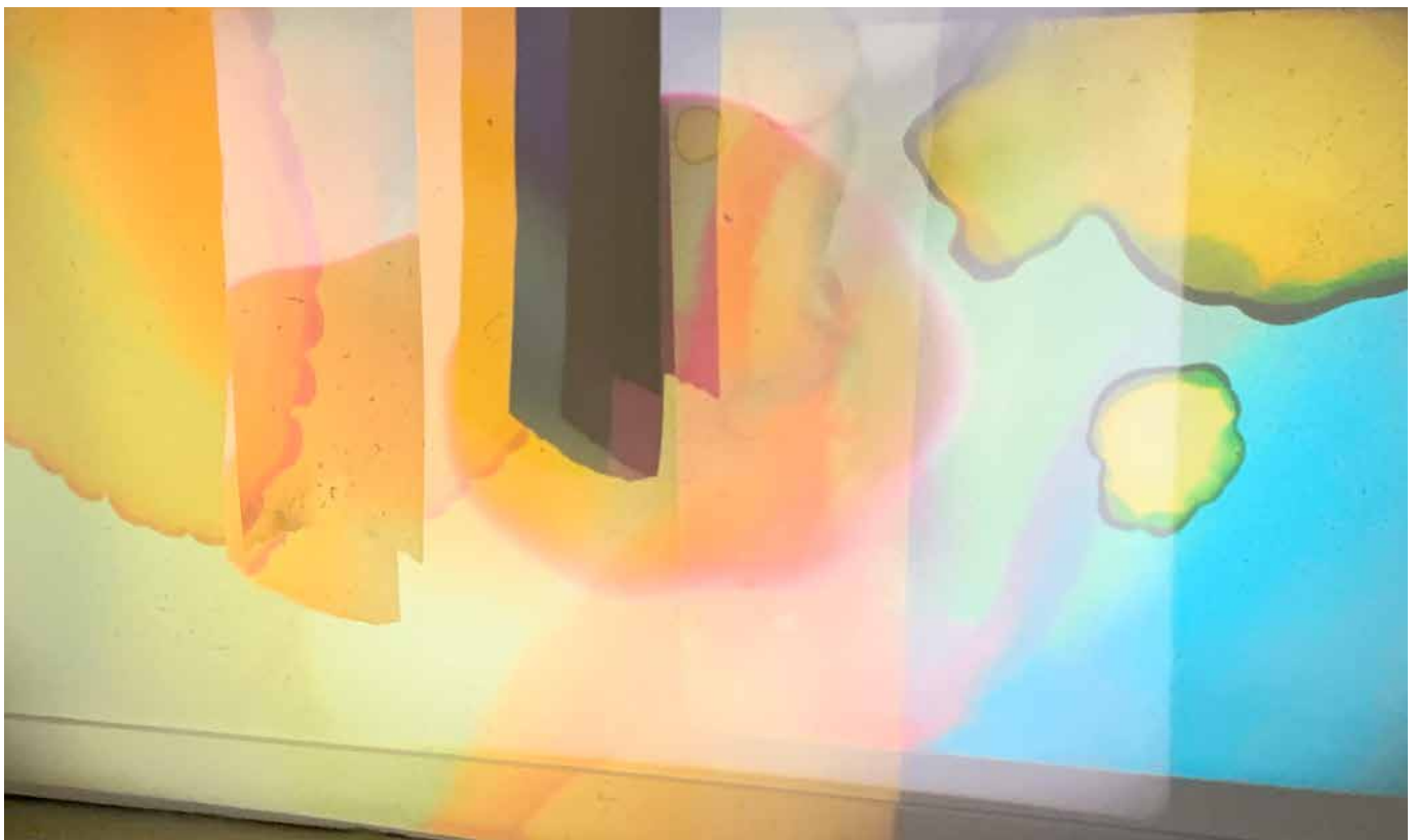
Upper: Jo Van Lambalgen, Space Jam, installation view, Nov 2019.