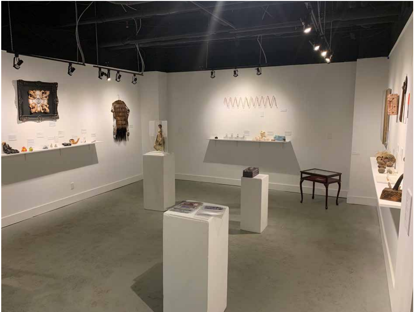
Cabinet of Curiosity, group show, March 2019.

Being a participating artist comes with a few expectations. Artists need to be active in the gallery setting regular gallery times for their residency period. We expect artists to set open public hours 3 days a week accumulating to 15+ hours/week (with any other time being flexible depending on the artist). Artists are responsible for their own installation of work and need to restore the space to gallery conditions after use.