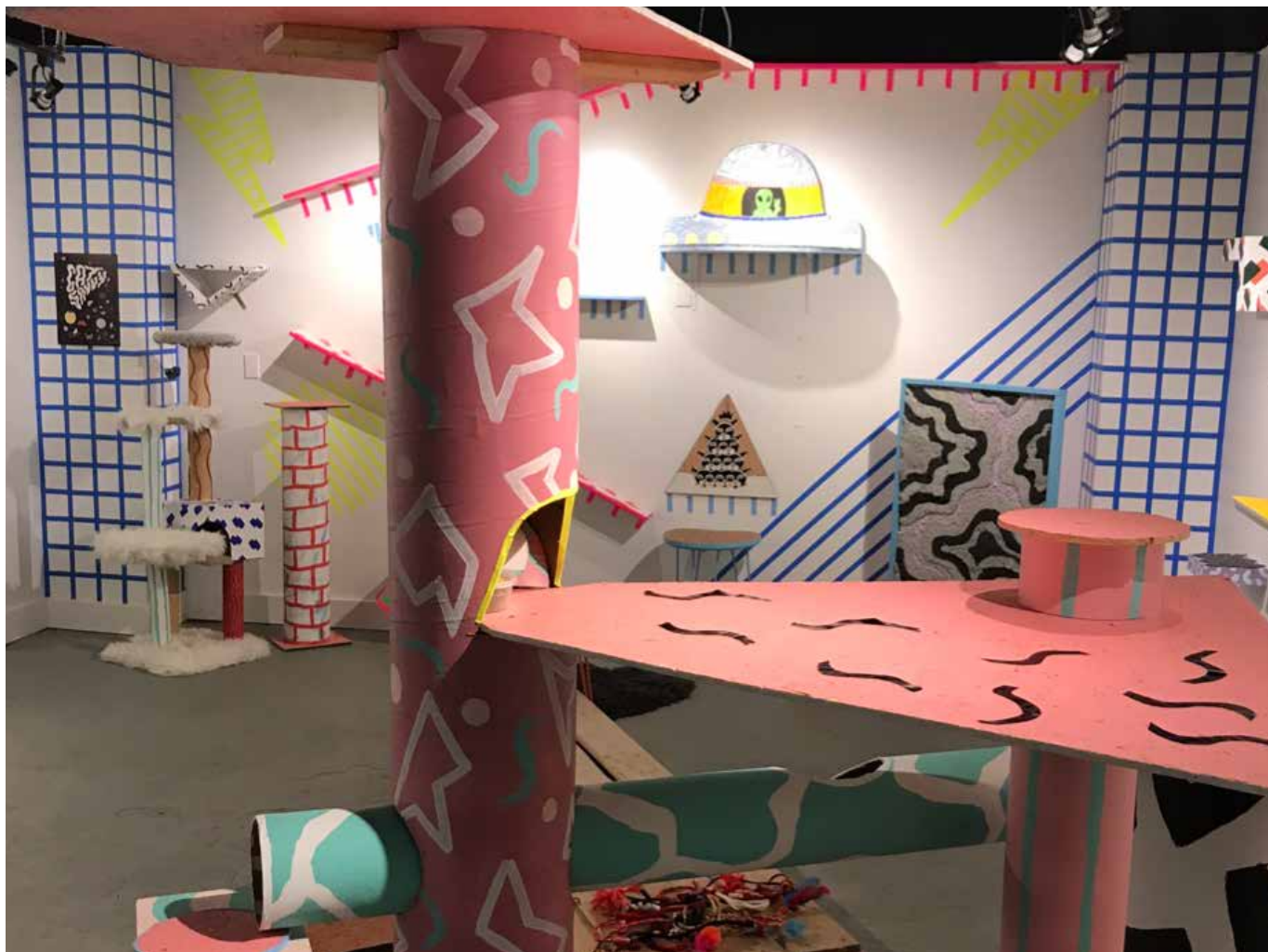
The Cats Meow, group exhibition, Nov-Dec 2018.